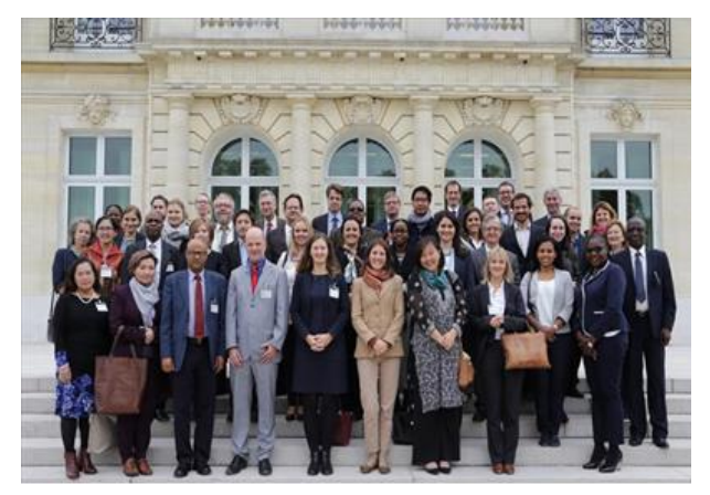
Key messages from the report of the meeting.

experience and learning about countries' evidence needs for social protection systems-building, and to consider how social protection assessments might best address those needs.