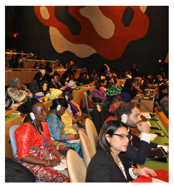
recognize older women's capacity for productive and active aging.

discussions gender-equality, of empowerment and sustainable development. This is in spite of the fact that the world's aging population is projected to reach 2 billion by 2050, with women age 60 years and older projected to comprise over 1 billion of the aging population at that time. Studies demonstrate that less than 10 per cent of older women need institutional care at any given time in old age. However, the stereotypical conflation of old age and dependency has established the basis for harmful policies, as well as traditional practices, that exclude older women from full participation in society and do not support or